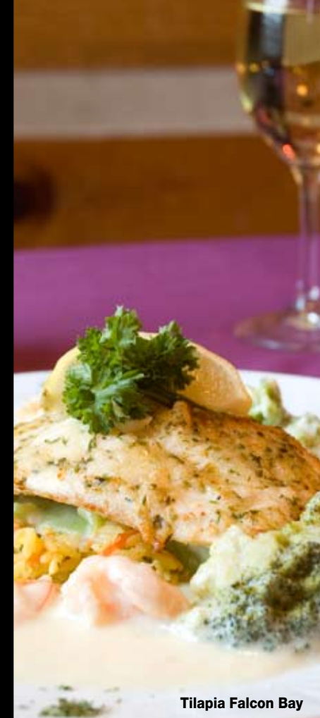
Tilapia Falcon Bay

NEW Atlantic Salmon Filet of cold water salmon prepared grilled, blackened, or broiled. Served with two Silver Sides