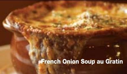
French Onion Soup au Gratin