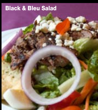
Black & Bleu Salad

Top your salad with... (Grilled or Blackened)