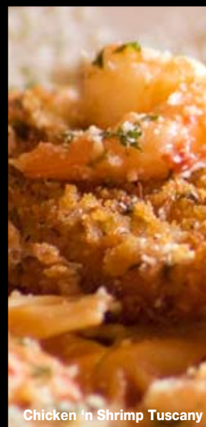
Chicken 'n Shrimp Tuscany

We Offer Bowtie Pasta, Fettuccine and Whole Wheat Penne