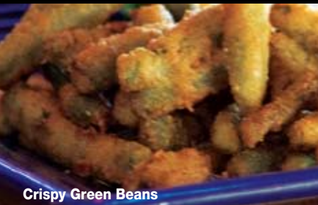
Crispy Green Beans