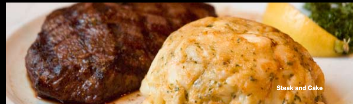
Steak and Cake

A tender 8 oz. sirloin steak topped with grilled shrimp and a honey bourbon glaze. Served sizzlin' over a bed of roasted vegetables with one Silver Side Upsize your steak to a 12 oz. Sirloin