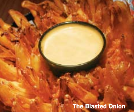
The Blasted Onion